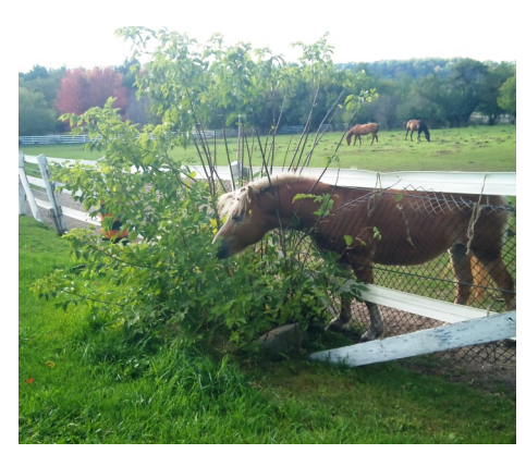
Just a little further...