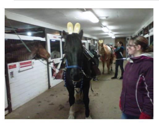
Is that the Easter Bunny?

"Are you thinking what I'm thinking?" Submitted by: Trisch Greschner